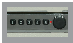
5BE ELECTRONIC LOCK