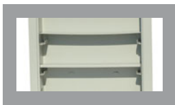
ONE OR TWO SHELVES